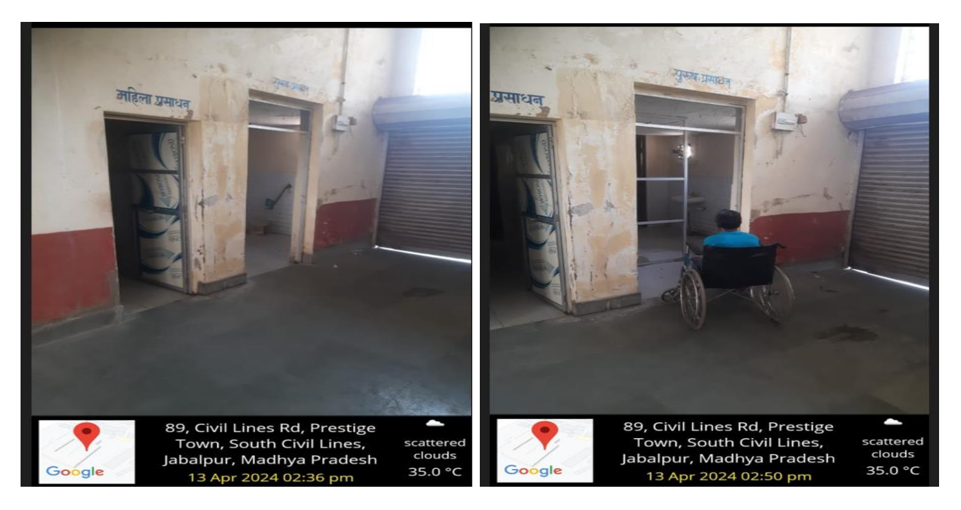
Figure 2a: Disabled Friendly Washrooms