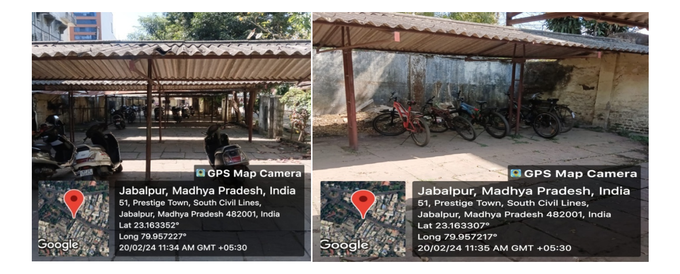
Figure-1: vehicles Stands Figure 2: BICYCLES Stand